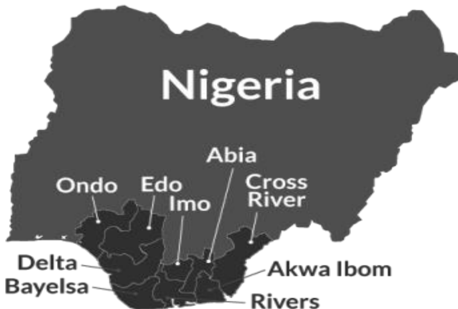
Figure 1: Constituent administrative states of the Niger Delta, Nigeria